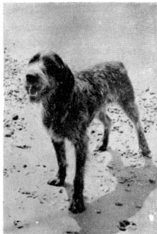
VALOUR d'ARGENT Westminster 1951—Best of Breed.

Subject to objection by any member, a simplified procedure in keeping with the intent of our constitution will be adopted for the conduct of routine parliamentary business. The Sec-Treas. will publish in each issue of "THE GUN DOG 'SUPREME'" a column titled "Routine Motions Before The Club". In this column will be motions of a routine non-controversial nature which the Sec-Treas. will assume to be carried unanimously by the Club thirty days after