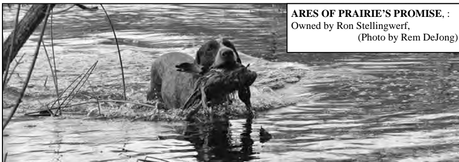
ARES OF PRAIRIE'S PROMISE, :